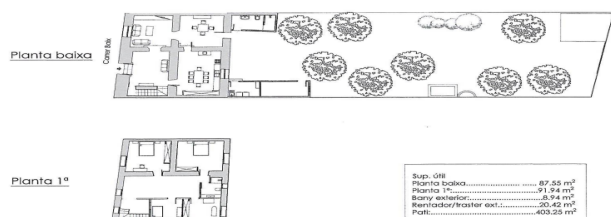
Vivenda Llofriu ESTAT ACTUAL